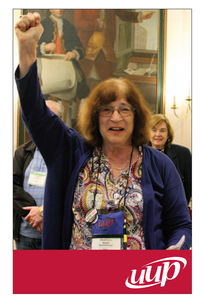
United University Professions

Presidential Appointee ottwood79@roadrunner.com (716) 773-3158